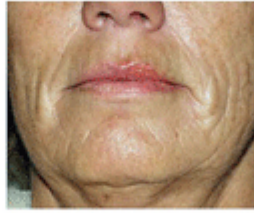
Pre Lip Wrinkles