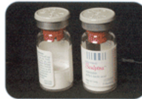
Figure 2 Sculptra™ vials.